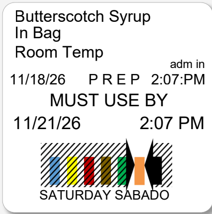
Format #8 Label Size: 1.2 x 1.1